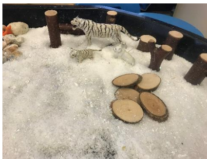
Fox class' winter themed tuff tray