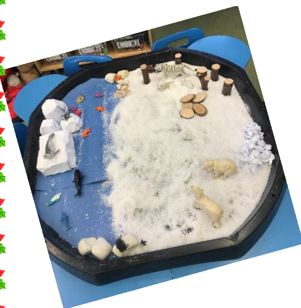
By Jude, Turner Class

Grim - Father unpleasant Blueprint - design, layout or a thing to build.