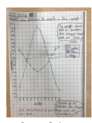
Super Science Vicky!