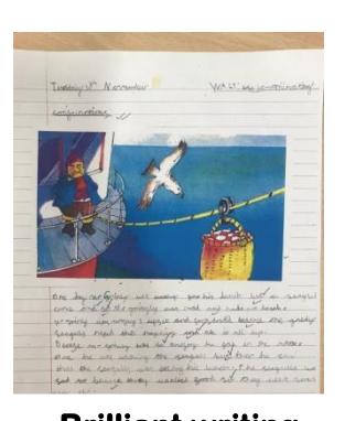
Brilliant writing containing conjunctions Phoebe!