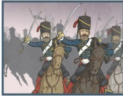
The Charge of the Light Brigade

Using the poem answer the questions based on the text. Remember to use your skimming and scanning techniques to find key words from the questions.