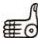
CH'AM 'to grab'