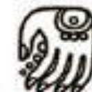
CHOK 'to scatter'